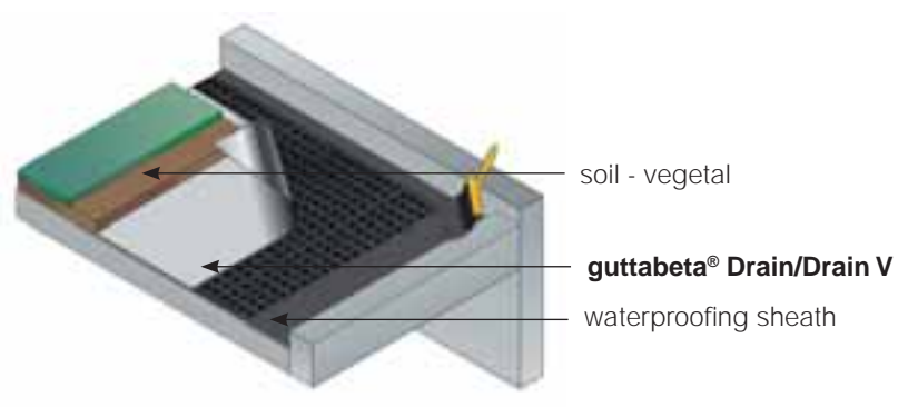
Fig. 2 Horizontal laying